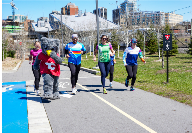
OC Owl and the Tamarack Ottawa Race Weekend Power Crew warming up at the multi-use pathway outside of Pimisi Station.